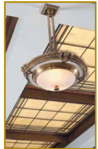
Skylights and light fixtures in a third floor meeting room.

The third floor light fixtures show an art deco influence. Remarkably, most of the original fixtures are still in place today after more than 90 years of continuous use.