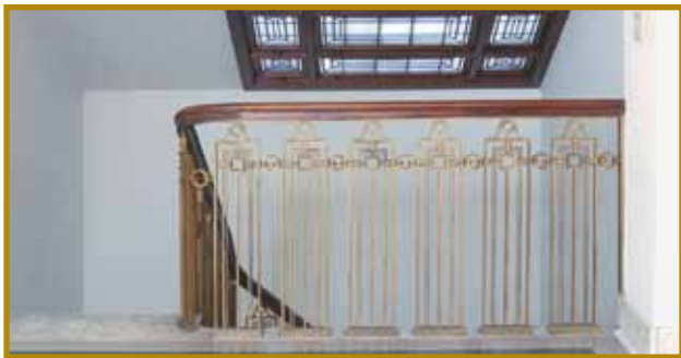
Decorative staircase metal work.

The vault cove may have been inspired by the decorative cove on the center ceiling of the building. The ceiling cove has a unique pattern that incorporates the lion motif and lotus pattern.