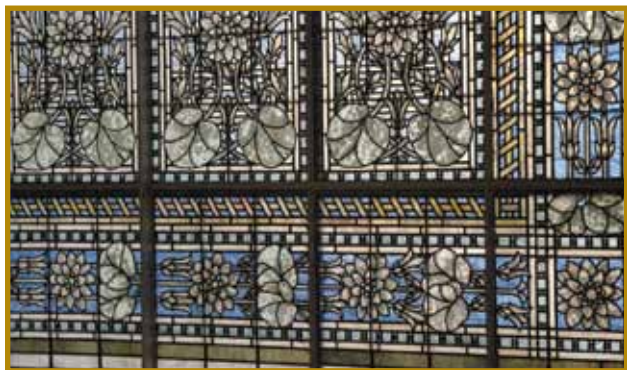
Original Tiffany stained glass.

The famous Tiffany Studios of New York created all of the building's stained glass windows from architect George Maher's sketches. The art glass was so dazzling that the local newspaper considered its installation newsworthy.