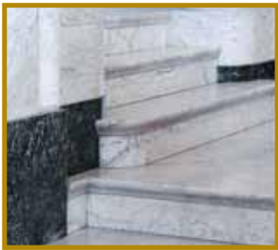
Details of white marble molding and steps.

Unlike the Tinos Green marble, the Italian white marble is uniformly smooth and strong. The floral bowls and the staircases are made of the white marble. Note the intricate detail of the marble work above the building's front door.