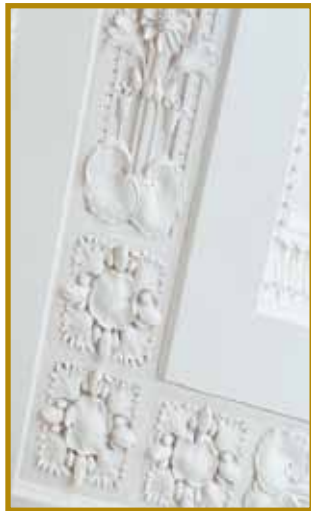
The frieze from above the vault.

(also called a frieze) outlines the ceiling. This cove was designed by Tiffany Studios, and it matches the general theme of the stained glass windows (also designed by Tiffany Studios). The intricate detail is remarkable – especially when one considers that to design, mold, and paint the entire cove cost only an additional $275.