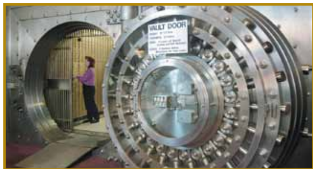
The mammoth steel vault.

The original souvenir booklet crafted in 1916 referred to the vault as "the mammoth steel vault." It was built by the Diebold Safe and Lock Company of Canton, Ohio, which has long been considered the leader in vault equipment.