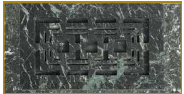
Green marble ventilation grid.