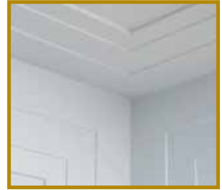
Decorative cove (above) and Prairie style molding.