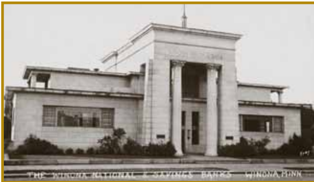
The completed building in 1916.

You will find many interesting artistic and architectural features on the tour. We hope you enjoy your visit!