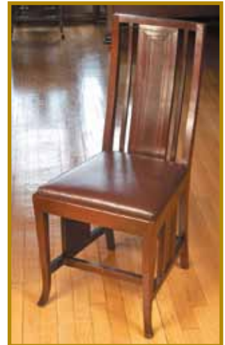
Prairie School-inspired furniture.

We hope you enjoyed your tour of Winona National Bank's Downtown building. If you would like to arrange a group tour, please call at least one day in advance (507-454-8800 or 1-800-546-4392 if calling from outside the Winona area). Winona National Bank gratefully acknowledges the Winona County Historical Society for the use of its resources in the publication of this book.