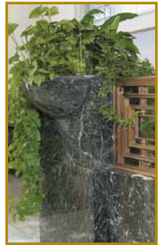
Green marble planters.

The white marble is called English Vein Italian white marble and was imported from the Carrara District of Italy.