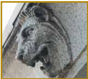
Details from the columns outside of the building.

Smaller stained glass windows are located at the North and South sides of the lobby. According to the newspaper article, the smaller stained glass windows each took a Tiffany artist 24 working days to complete.